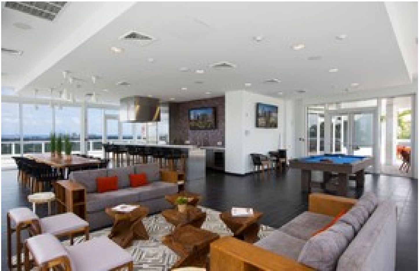
Vu New River