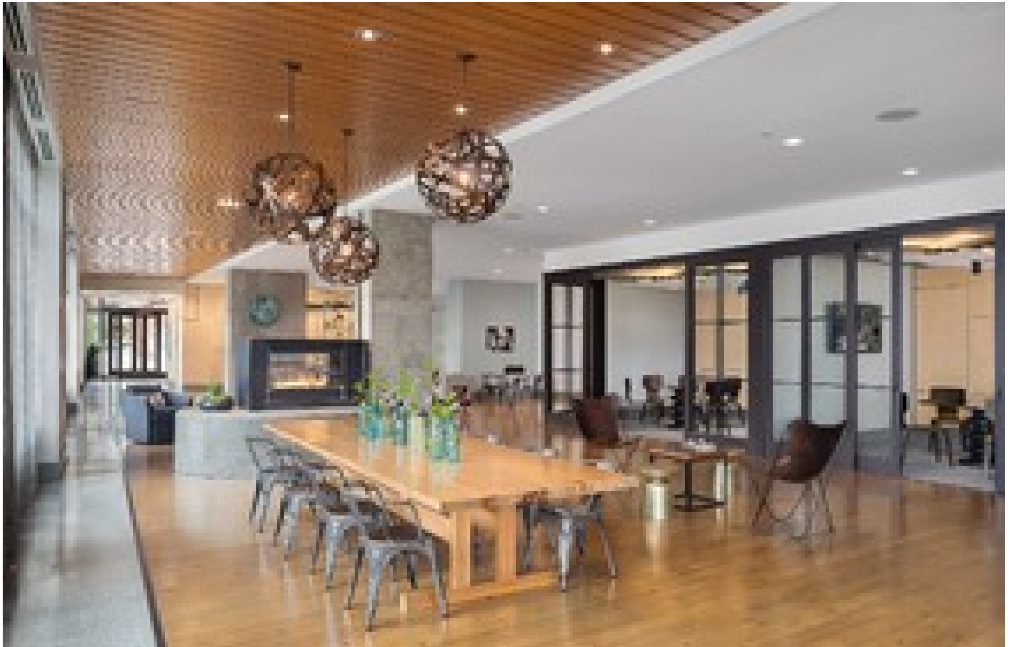
315 on A