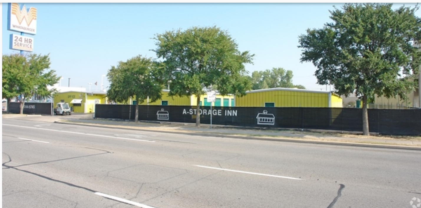
A-Storage Inn in Fort Worth, TX, One of two self-storage deals brokered by Colliers in Texas