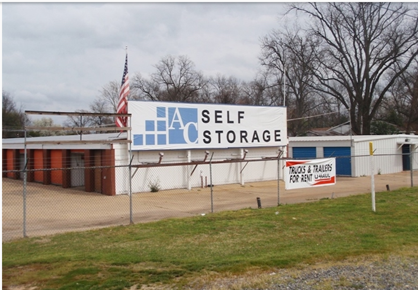
This Bossier City, LA facility recently sold for $2.34 million ahead of a pending foreclosure.